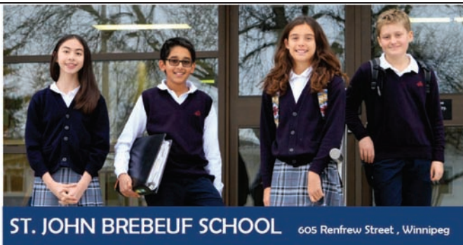
ST. JOHN BREBEUF SCHOOL 605 Renfrew Street, Winnipeg